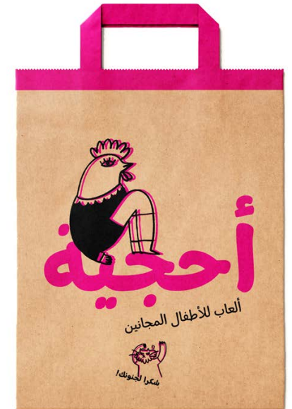
Nawin used on printed supports for branding purposes