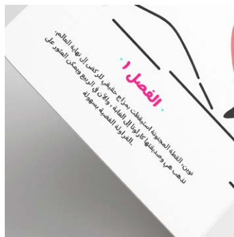
Sample of a children's books