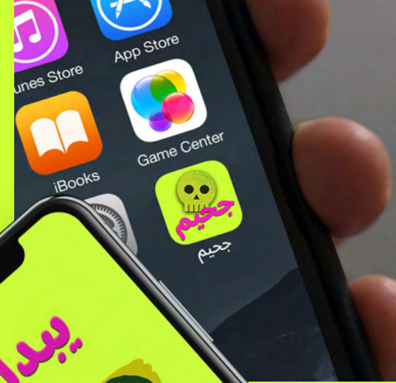
Nawin used in apps and games