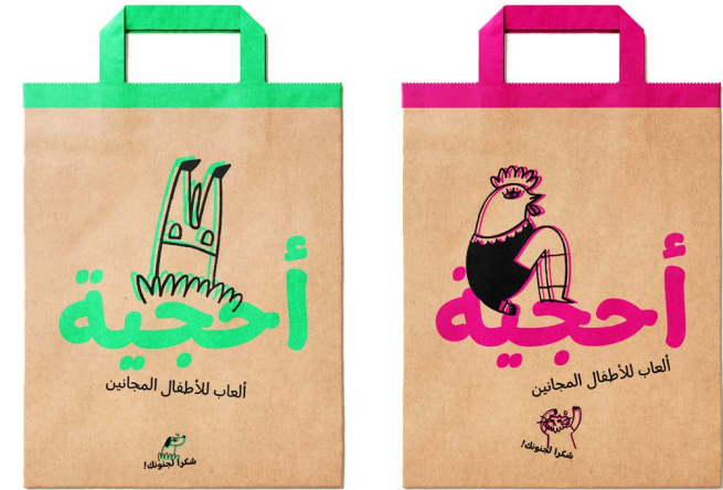
Nawin used on digital and printed supports for branding purposes